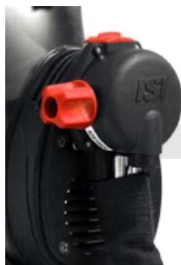
RDV First breath activation