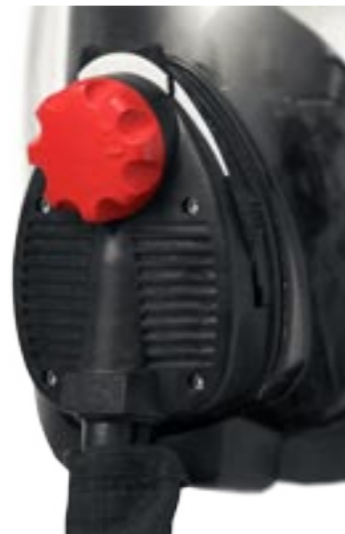
AirSwitch® RDV Switch instantly from ambient air to cylinder air