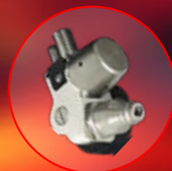
Rapid Intervention Coupling (RIC)