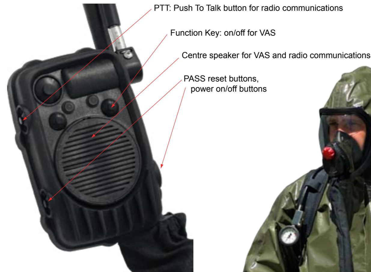
PTT: Push To Talk button for radio communications